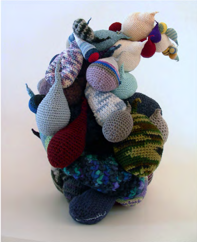
Jeanne Tremel Bygones (2008) mixed yarn, thread and safety pins 18 X 18 inches