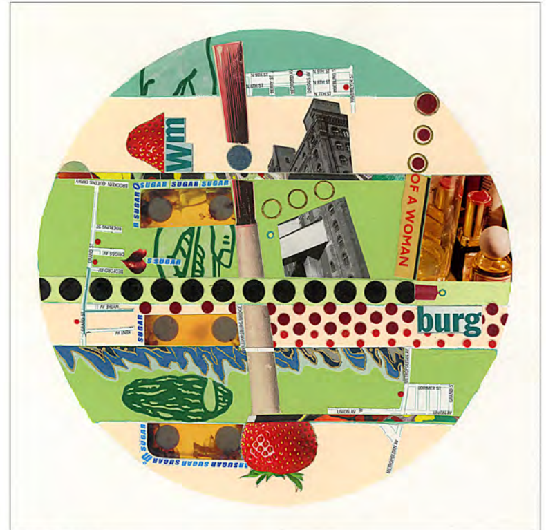
Stacy Greene Williamsburg, Brooklyn - Searching for Pierre Loti (2013) mixed media 7.5 X 7.5 inches

Stacy Greene has chosen a much different path mimicking in life and expressing in art the ongoing series Searching for Pierre Loti . In it, we see specific symbols accenting curious