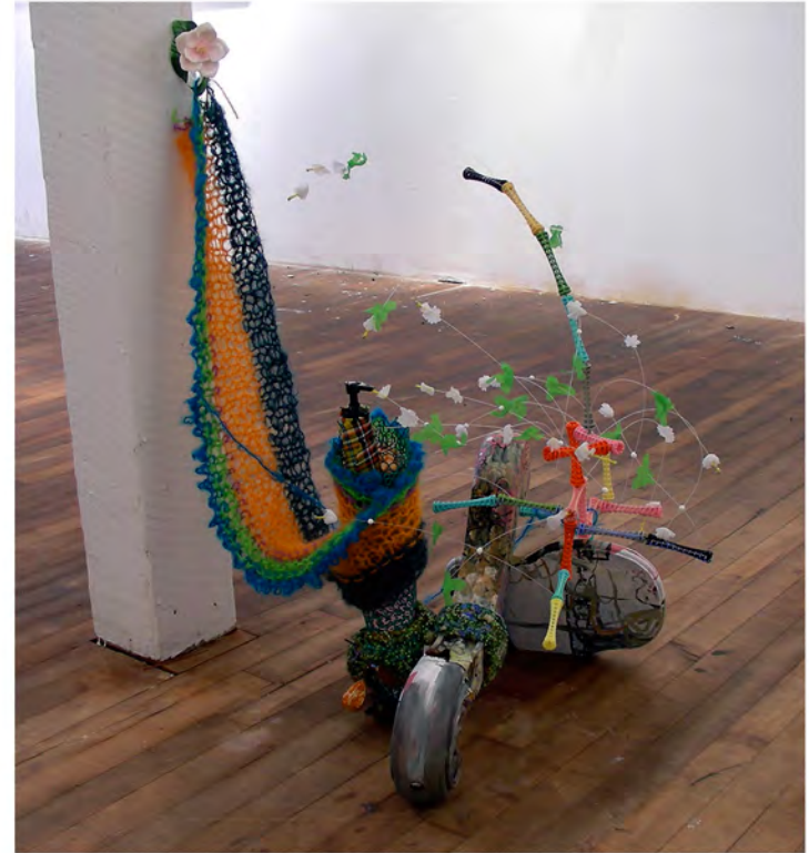
Jeanne Tremel, Shrub Contraption (2013) wood, yarn, oil paint, ceramic, plastic, metal and fabric 30 X 30 X 24 inches

Jeanne Tremel is an uninhibited elaborator. Fact and fantasy come close to meeting but they never quite coalesce. What we do know from her work is that nature can be rivaled if the spirit is free from inhibition and the hands, heart and mind are willing to challenge and create.