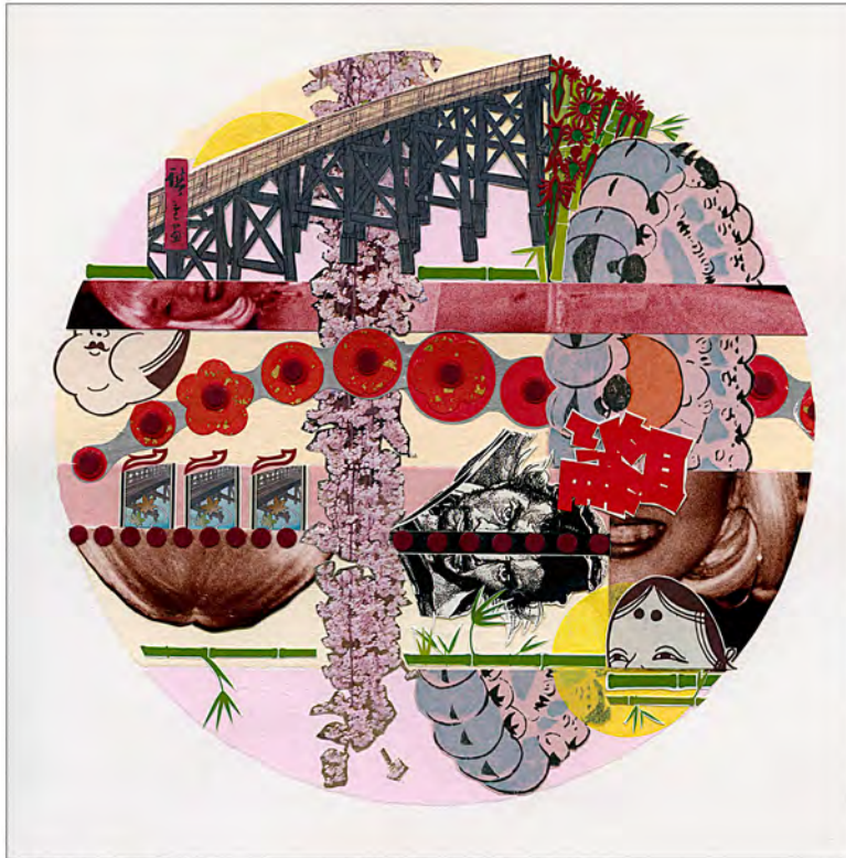
Stacy Greene Kyoto #3 - Searching for Pierre Loti (2014) mixed media 7.5 X 7.5 inches

Stacy Greene has chosen a much different path mimicking in life and expressing in art the ongoing series Searching for Pierre Loti . In it, we see specific symbols accenting curious