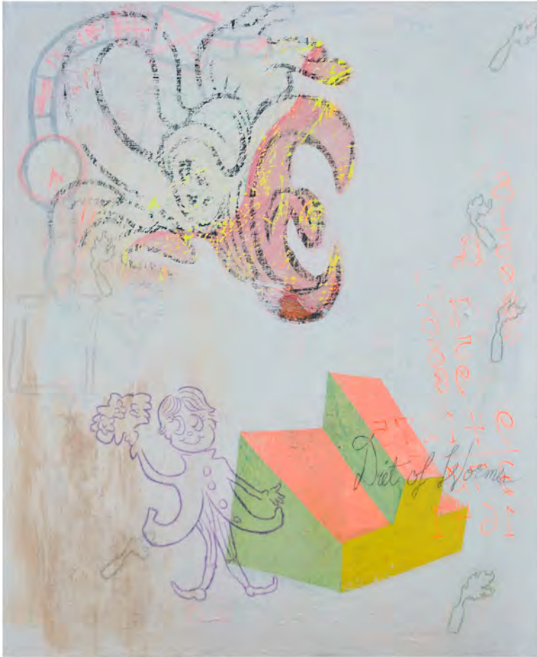
Bill Gusky Diet of Worms (2013) acrylic and colored pencil on canvas 30 X 24 inches