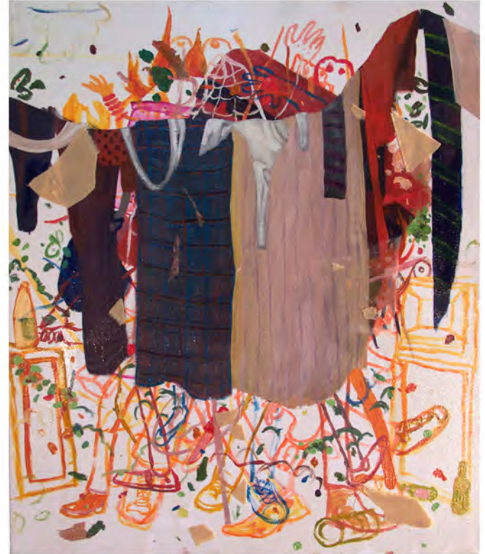
Eric Ramos Guerrero, Clothesline 1 (2013), oil on canvas, 20 X 24 inches actual with the virtual. As a result, the here and now is mixed with parallel realities colored by pure emotion.

The art of Eric Ramos Guerrero embodies a new age of Social Realism. His art reveals how more and more, we see the world in overlapping, and at times disjointed experiences that mix the